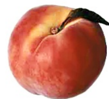
my fresh Georgia peach