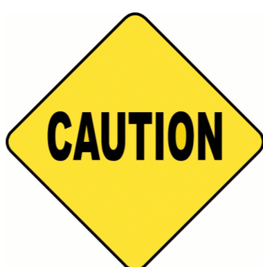
that yellow caution sign