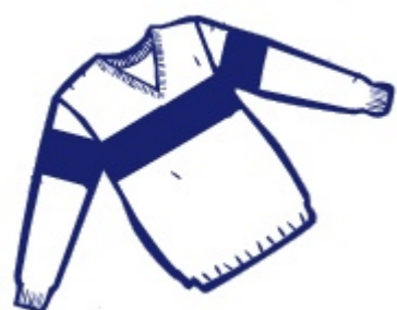
the Irish wool sweater